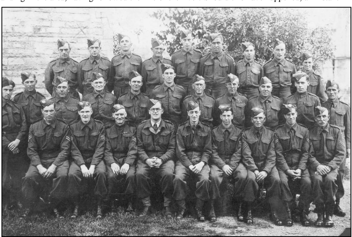
Fig 27d. Castor and Ailsworth Home Guard 1943.

alert was to be sent to the HQ in Peterborough heralding an imminent invasion. Following advice received from the Ministry of Defence, nationwide, all kinds of obstructions were to be placed at entrances and exits to every village in case of invasion by German tanks. Ancient farm carts, old tractors, ploughs etc, long past their sell-by date, stood in